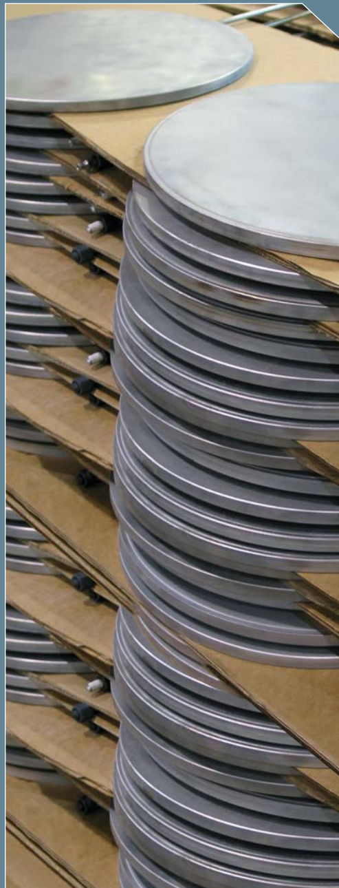
An order of Total Earth Pressure Cells being prepared for shipment.

Total Earth Pressure Cells are designed to measure stress acting on plane surfaces. The TP-101 series Total Earth Pressure Cells are constructed from two circular stainless steel plates, welded together around their periphery. The annular space between these plates is filled with deaired glycol. The cell is connected via a stainless steel tube to a transducer forming a closed hydraulic system. The stress is then converted to a signal and may be remotely read on a variety of portable readout units or data loggers. Various types of transducers are employed dependent on site requirements.