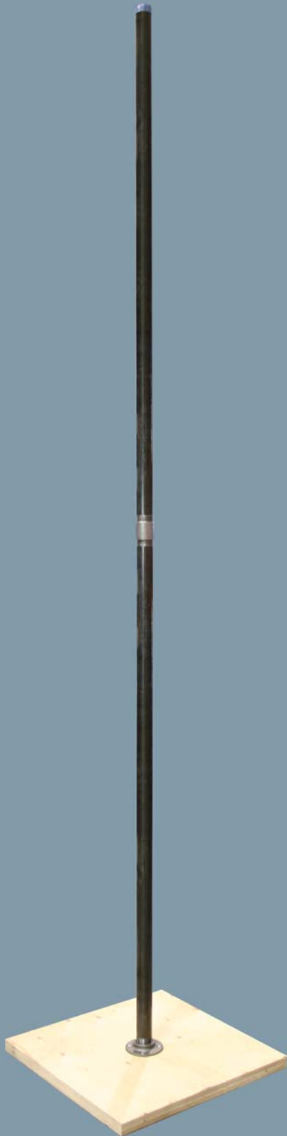
Settlement Plate shown assembled with two Riser Pipes

RST Embankment Settlement Systems provide simple means of measuring settlement under an embankment.