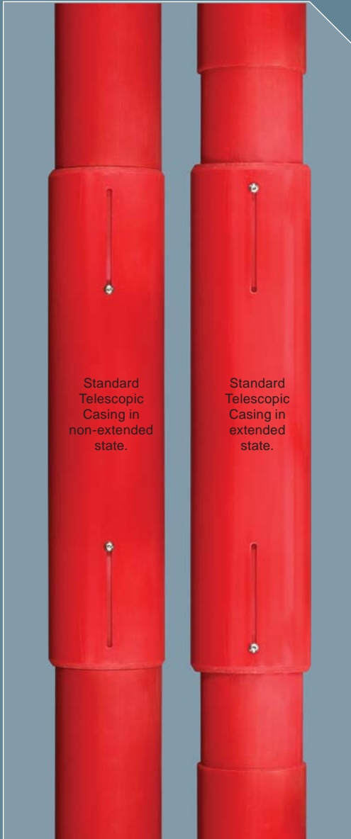
Standard Telescopic Casing in non-extended state.