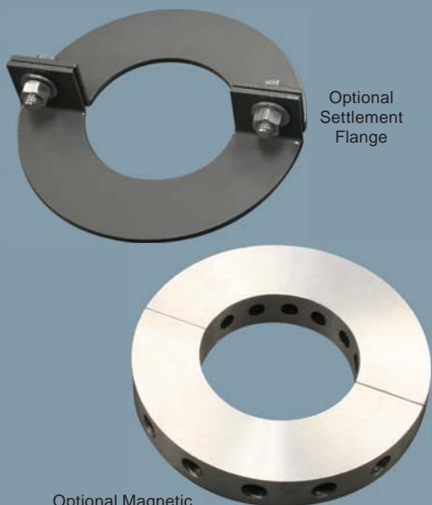
Optional Settlement Flange