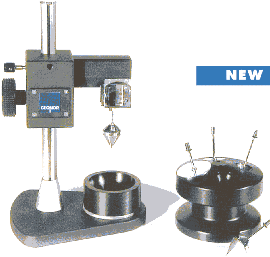
Geonor fall cone apparatus