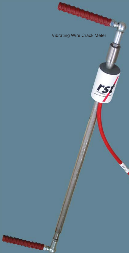
Vibrating Wire Crack Meter

Submersible (up to 200 m) versions are available for installation on the upstream perimeter joint of CFRD dams. 2-D and 3-D versions are available.