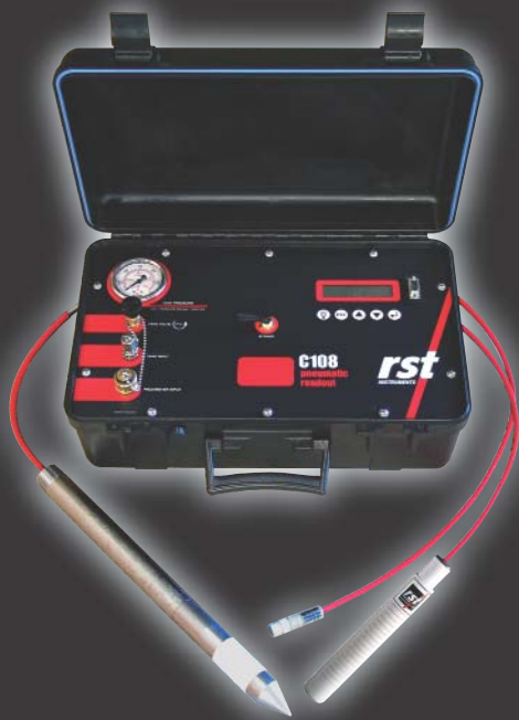
C108 Pneumatic Readout with RST Pneumatic Piezometers

RST Pneumatic Piezometers are assembled to client specified length, tested, calibrated, and ready to install.