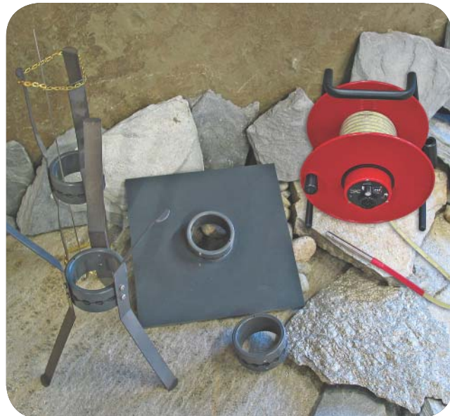
Teflon (R) is a registered trademark of E.I. du Pont de Nemours and Company or its affiliates. Specifications may change without notice. SSB0001E