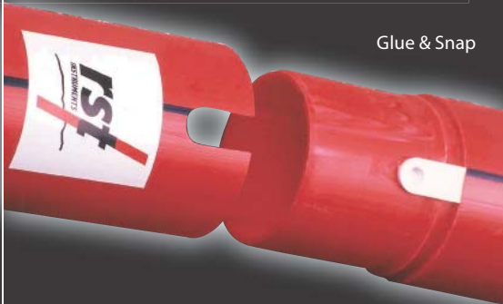
Glue & Snap